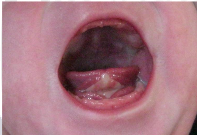
Picture of a large ulcer 2 days after division of a severe anterior tie (normal healing but usually they are smaller than this one)

As already explained as the wound heals it turns white (sometimes with a yellow/slightly greenish tinge) to form a patch resembling a mouth ulcer and this is normal. This usually occurs within 48 hours and disappears within a week to 14 days. As it heals it can appear to be lifting at the edges and in some babies the edge can look dark red/orange. This is all part of normal healing.