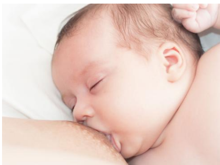
Baby with top lip in neutral position

To understand how an upper lip tie may affect feeding we need to look at how the baby attaches to the breast. Older breastfeeding literature talked about both the upper and lower lips flanging during breastfeeding to form 'fish lips'. The idea that 'fish lips' are a good sign still litters the internet and popular literature on breastfeeding. However, ideas about the role of the upper lip have changed. In actual fact only the lower lip should flange. If the latch is optimal the upper lip should be in a neutral position (See Supporting Sucking Skills by Catherine Watson Genna, 2013, p 34).